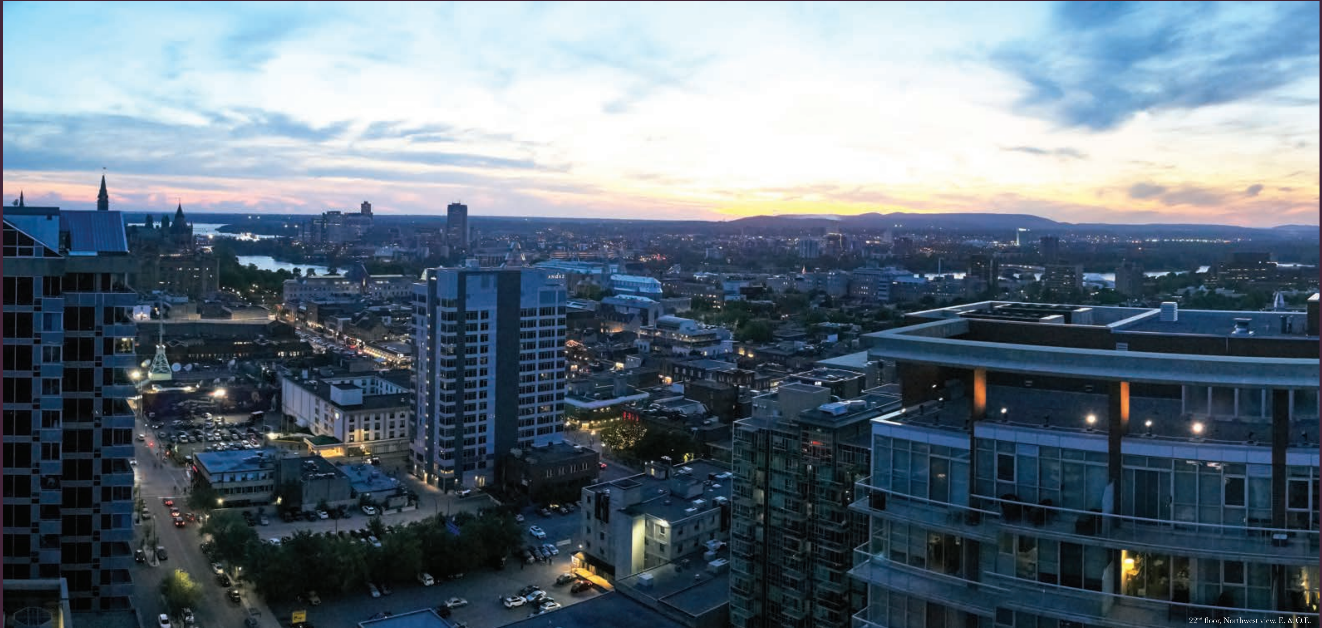
22 nd floor, Northwest view. E. & O.E.